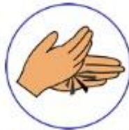
Karate Chop Point

For The EGO Tamer® (TET) Tapping Technique